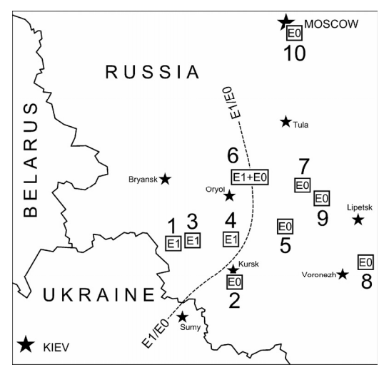
Fig. 1. The occurrence of E0 and E1 haplotypes in studied localities and supposed the two phylogroups border (dashed line). For definition of locality numbers see Table 1

As markers of phylogenetic lineages, we used sequences of mitochondrial control region and cytochrome b(cytb) gene. DNA extraction and amplification were done according to the method described earlier (Feoktistova et al., 2017). The sequences were obtained using the BigDye Terminator v. 3.1 kit and sequencing on a Genetic Analyzer 3500 (Thermo Fisher Scientific). Quality control of the automatic decoding of chromatograms, the merging of forward and reverse individual sequences, and their alignment and storage was completed using BioEdit v.7.2.5 software (Hall, 1999). The se-